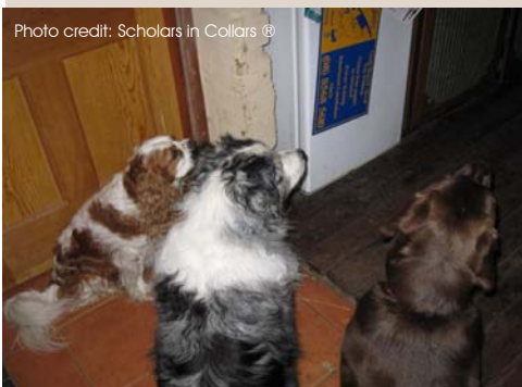
Above: Visitor Chester (L) from Upper Blessington, Brodie (c) of Birdwood & Bella (R) of Oakbank showing nice kitchen manners.