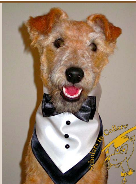
Above: Jasper of Bridgewater

For more fun with names go to: www.bowwow.com.au