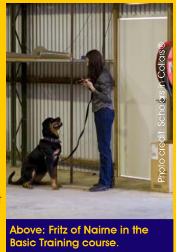
Above: Fritz of Naime in the Basic Training course.