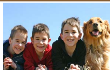
Make sure your dog has plenty of interaction with friendly children.

It is up to you to make sure your dog is safe around children. And a happy dog is usually a safe dog.