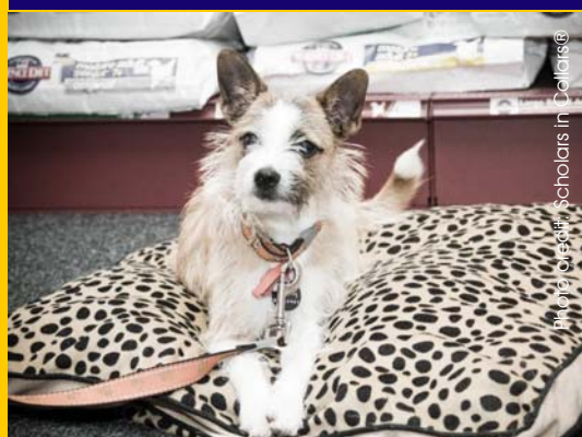
Below: Buddy of Mt Barker lying quietly in the Calm. Controlled. Centred class.