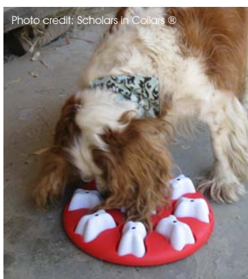
Above: Chester road-tests the Nina Ottoson Dog Magic Puzzle.

Dogs need fun and interesting activities. Puzzle toys get dogs thinking and keep them busy. Toys range in difficulty and new ones are coming on the market all the time. Kong toys are one example and are now very popular. These are stuffed with food and the dog needs to chew, lick and paw at the toy to get food out. Stuffing a Kong with wet food, then freezing it will keep your dog busy for longer. Buying different kinds of toys is important so that your dog has the opportunity for different kinds of play. Puzzle toys encourage problem solving. In the photo [L], Chester is busily looking for pieces of dried liver hidden under the plastic bones in the Nina Ottoson's Dog Magic Puzzle . With this toy, dogs need to use their paws, nose and brains to work out where the treats are hidden. Great fun for dogs and a real time waster for humans watching!