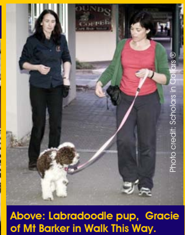
Above: Labradoodle pup, Gracie of Mt Barker in Walk This Way.